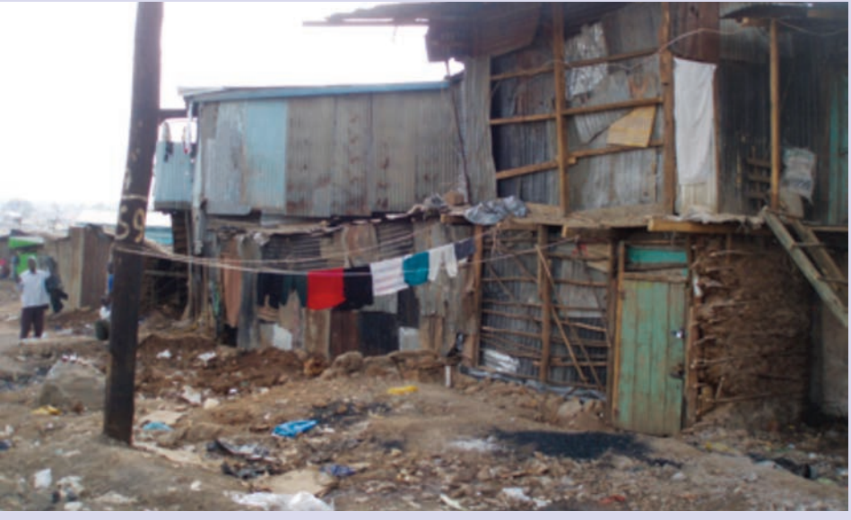
Wash day in suburbia

for us with the local community leaders and we were told to stick together because of the danger, shepherded by the Christian Aid staff who had all been on anti-terrorism and kidnap training (even if they were tiny 30 year old bubbly women). Inevitably each of us would wander off down a side alley. But at no time did we feel threatened or at risk, and only found smiles and friendship in these poverty stricken slums.