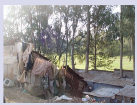
Golf course next to the slum

The railway line was a popular thoroughfare and, further back were shops including a bible binder, barbers, dentist and electrician. Lots of school children came towards us, the young ones with huge smiles shouting "how are you?" They were all wearing school