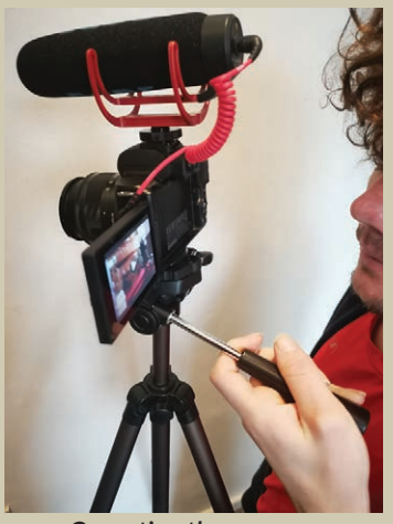
Operating the cameras

Cramond Kirk will shortly begin regularly streaming its services from the church to a much wider audience. The objective is to allow people at home, or in the Kirk Hall, or indeed anywhere in the world to participate. Restrictions on the number of people in the church look likely to continue for some time so this initiative is needed urgently.