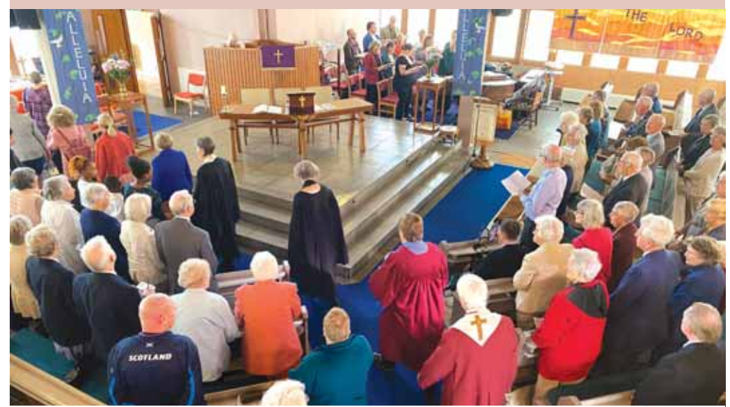
Service on 3rd September to celebrate the union between Cramond Kirk and The Old Kirk and Muirhouse